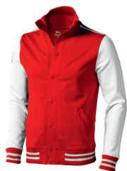
25 red-off white