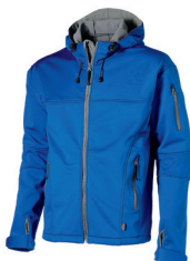
42 sky blue-grey