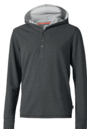
98 heather charcoal