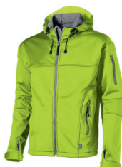
64 mid green-grey