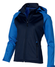
49 navy-sky blue

S Screenprint D Deboss L Laser Engraving E Embroidery T True Edge Transfer