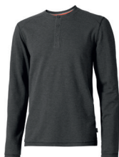
98 heather charcoal