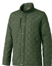
70 army green