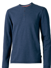
53 heather blue