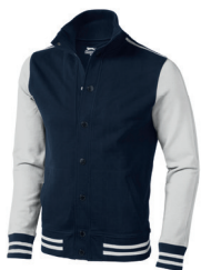
49 navy-off white