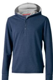
53 heather blue